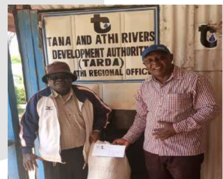
Empowering Communities, Growing Forests