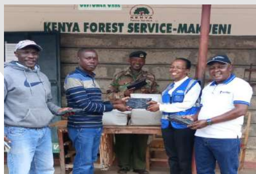
Scaling Up For A Greener Kenya