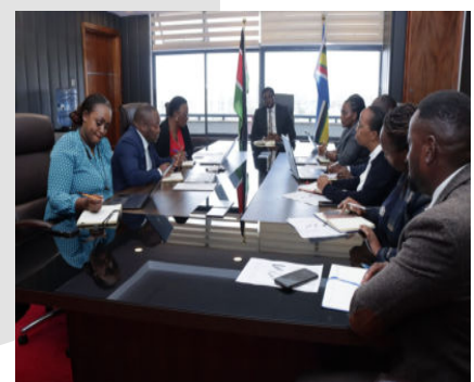
TARDA And NAMICO Advance Strategic Partnership On Sustainable Mineral Exploration Within The Tana Basin