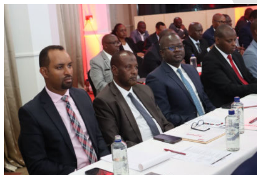
TARDA Participates In The 1st Consultative Engagement With The Office Of The Chief Of Staff And Head Of PSC

On 12th November 2025, TARDA successfully underwent its official Performance Contract (PC) Evaluation for FY 2024/2025 — marking the culmination of a year of tangible results and measurable impact across the Tana and Athi River basins.