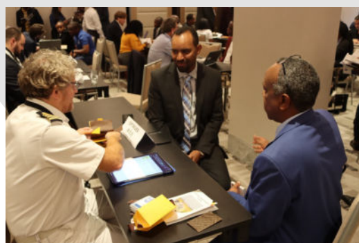
Driving Basin Transformation Through Strategic Global Partnerships