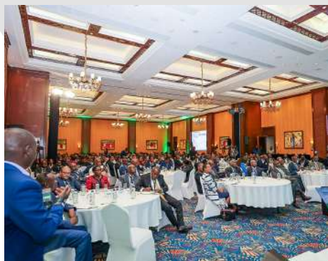
TARDA Participated As Strategic Partner At Landmark PPP Symposium