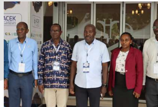
TARDA joined The ACEK 4th Annual Conference